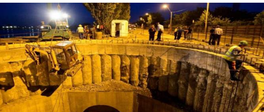
Extension and renovation of water and wastewater infrastructure in Arges County