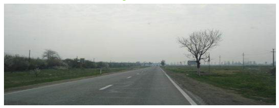
DN6 (Alexandria-Craiova) – feasibility study and design