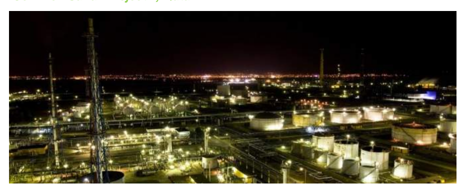
Petromidia Kerosene Hydro-treating Revamp, Romania