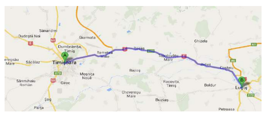
Timişoara-Lugoj section 2 – design