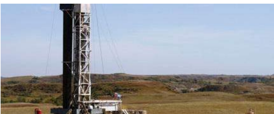
ESHIA, Land Leasing and Engineering Services in Romania (confidential client)