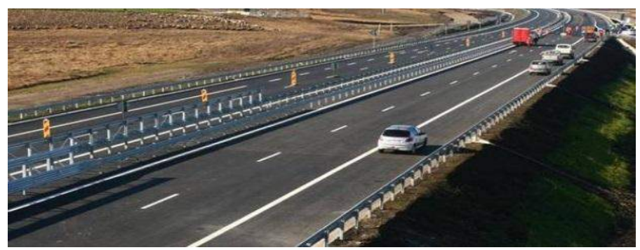
Lugoj-Deva section 2 – design