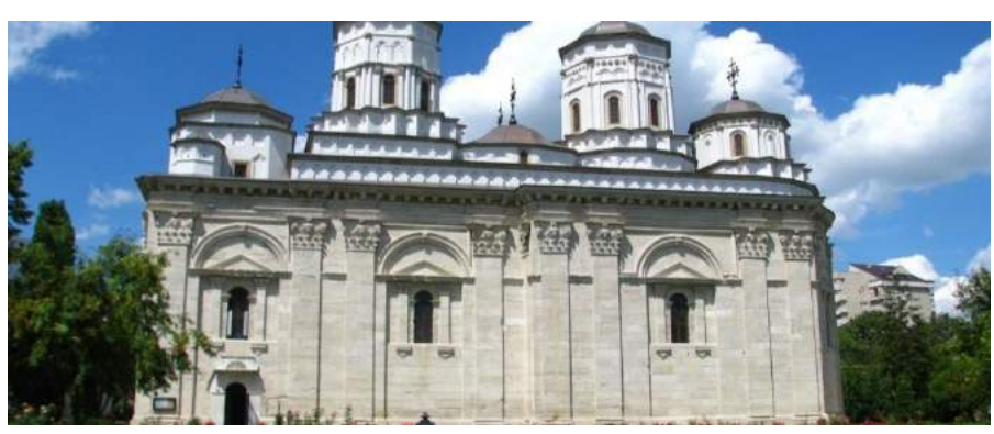
Golia Monastery renovation, lasi