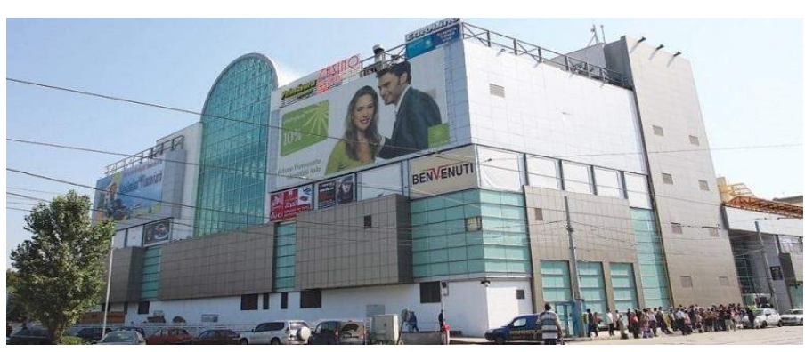
Citi Mall exterior parking lot, Bucharest