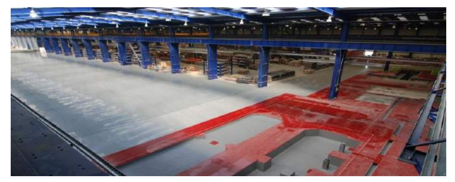
Bamesa steel services center, Arges County