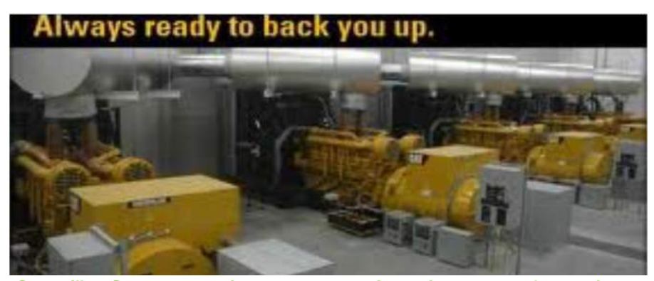
Caterpillar, Germany – project management for various power plant projects