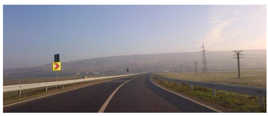
DN1H and DN24 – feasibility studies and design