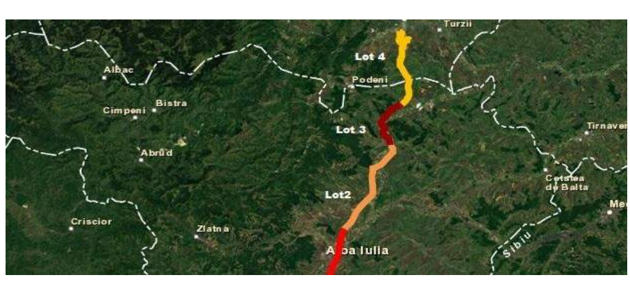
Sebeş-Turda section 3 – design