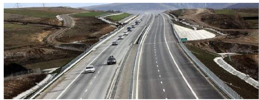
Lugoj-Deva section 4 – construction supervision