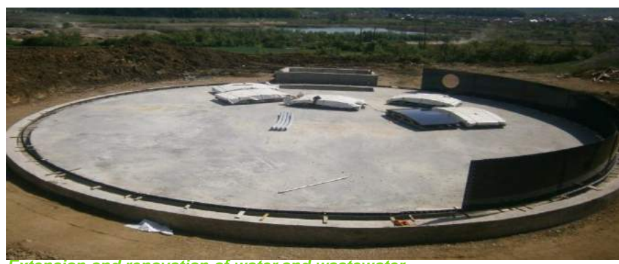
Extension and renovation of water and wastewater infrastructure in Hunedoara County