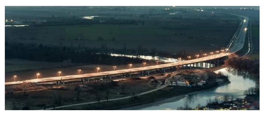
Orãștie-Sibiu section 1 – design