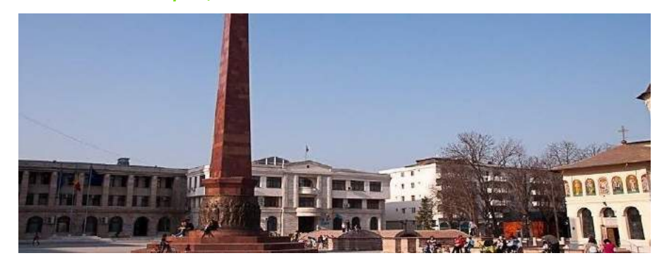
Focsani City Center renovation