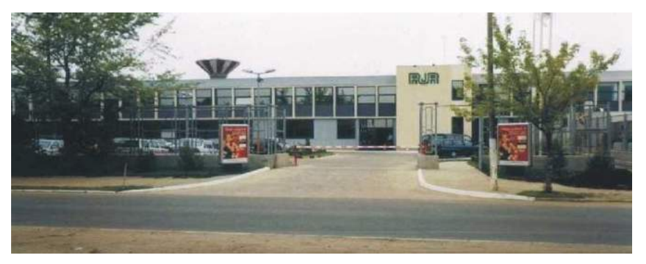
JTI Tobacco Factory Bucharest, Romania – EPC