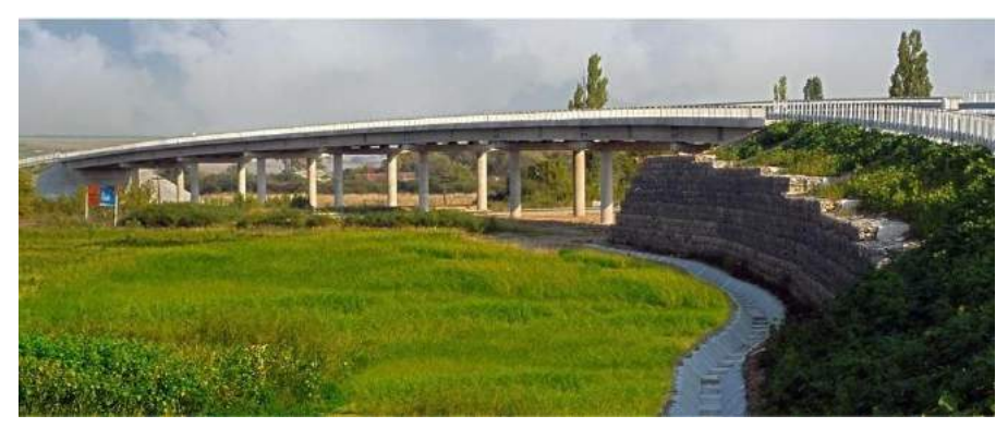
Lugoj bypass – construction supervision