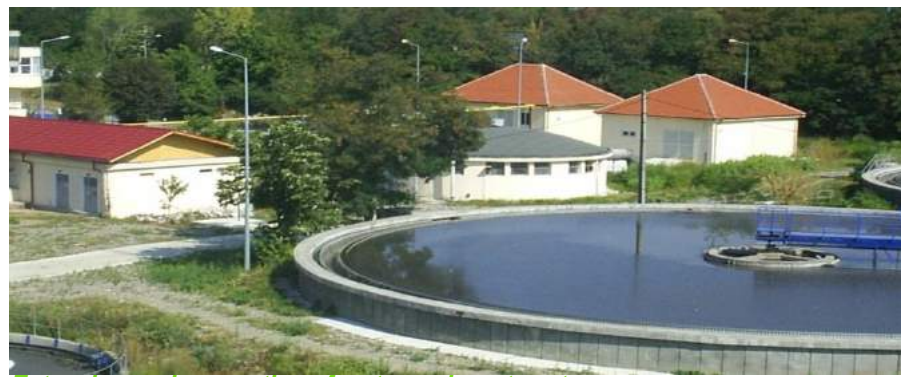
Extension and renovation of water and wastewater infrastructure in Neamt County