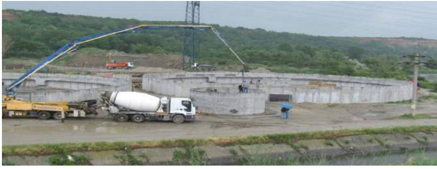
Extension and renovation of water and wastewater infrastructure in Olt County