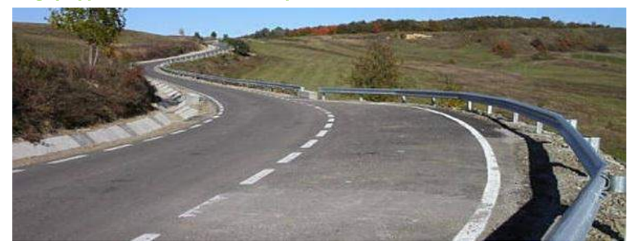
DN76 (Deva – Oradea) – construction supervision