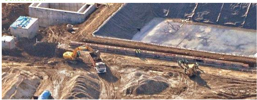
Barasti bio-treatment plant, Olt County Construction