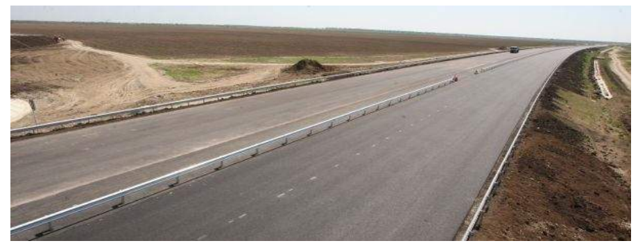
DN56 and DN56A – design and construction supervision