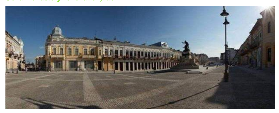
Botosani City Center renovation