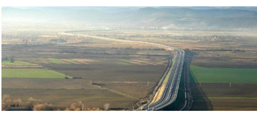
Orãștie-Sibiu section 2 – design