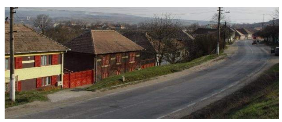
DN14, DN15 and DN15A - design