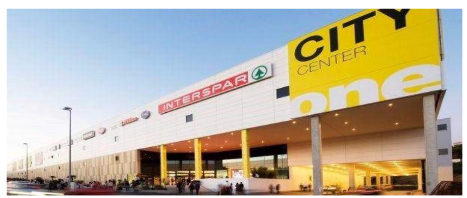
City Center One, Split, Croatia