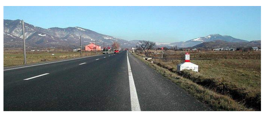
DN1C and DN17 – design and construction supervision