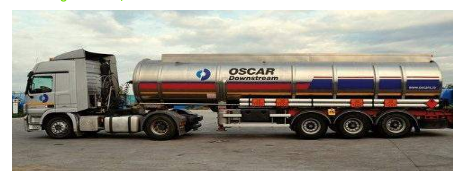
Oscar Downstream oil delivery warehouse, Bucharest