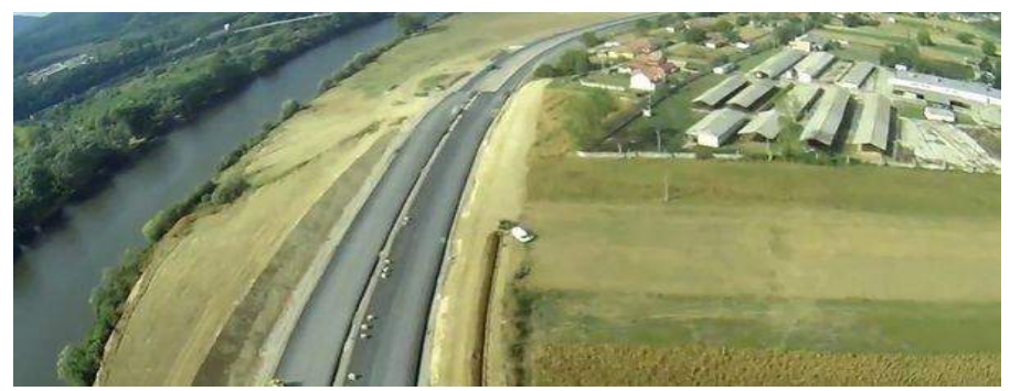
Deva-Orãștie – construction supervision