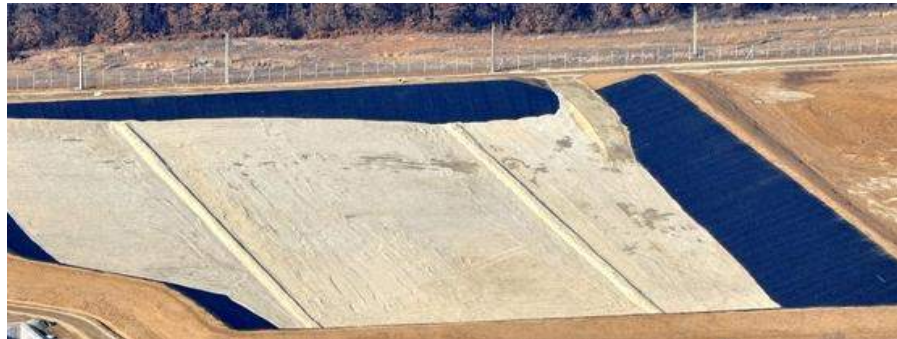
JTicleni bio-treatment plant and landfill, Gorj County Construction